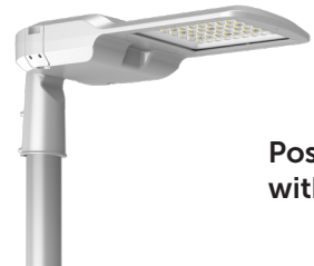
Post-top mounting without arm